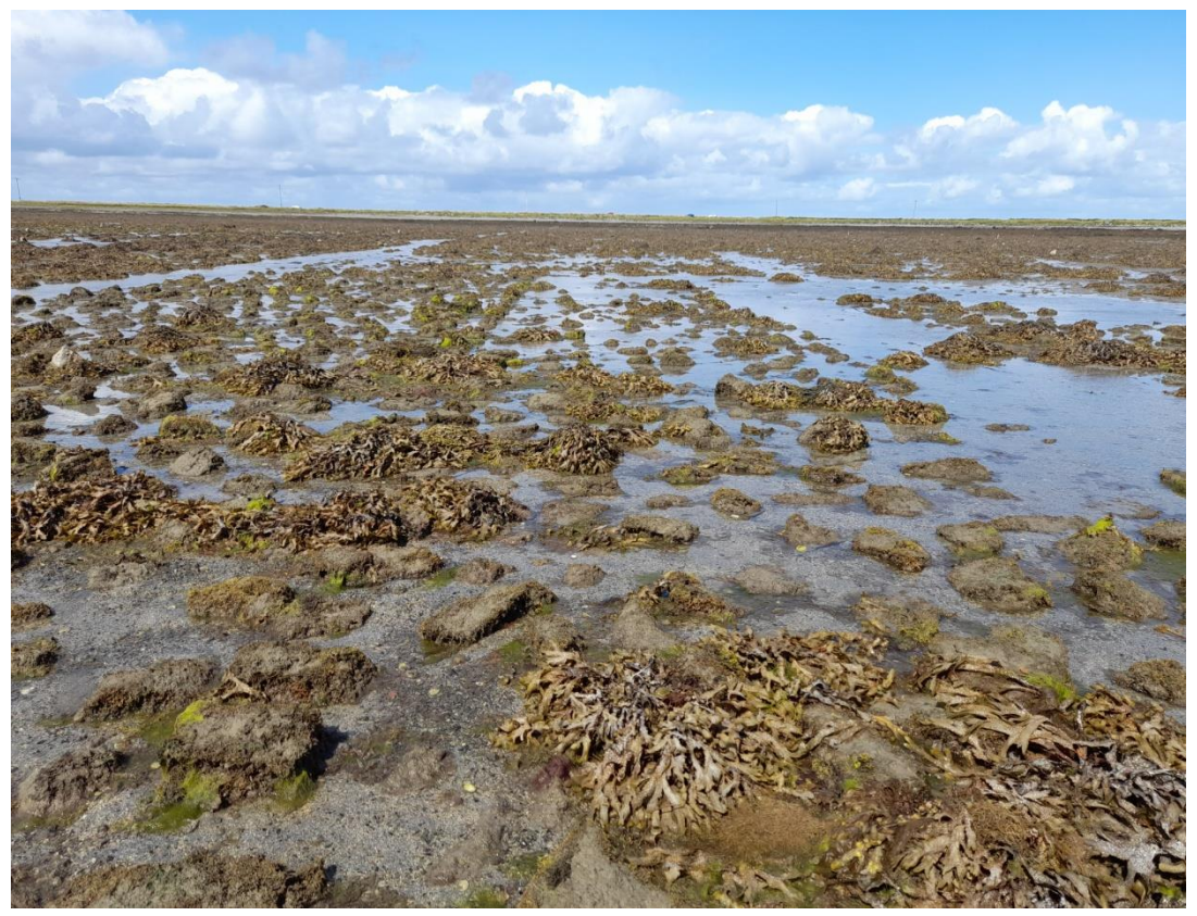
Figure 3: Fine muddy sand and rocks in part of the site, with some rocks covered in seaweed.