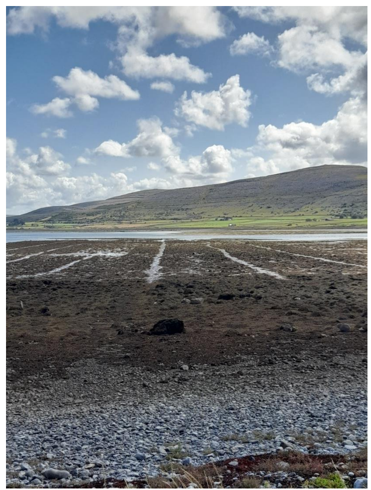
Figure 4: showing evidence of tracks created to facilitate traditional seaweed harvesting.

A folio search of the website of the Property Registration Authority of Ireland, undertaken by the Secretary to the Board showed no seaweed rights in folios directly adjacent to the foreshore. It should also be noted that no appeals were made against the application or the appeal on grounds of existing users, nor were any submissions made regarding this issue.