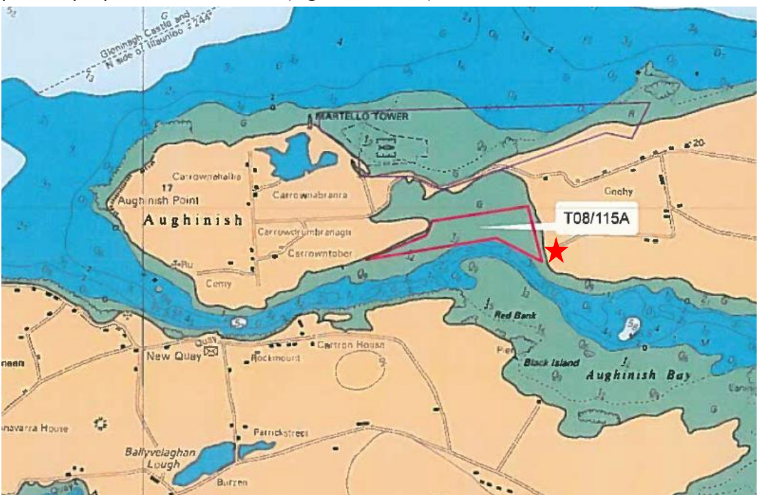
Figure 1: Site location and outline. Proposed access point marked with red star

The site is located next to Aughinish Island, on the Galway Clare border at the south side of Galway Bay (Figure 1). The site is in an area which is both an SAC and SPA. It comprises of a rocky upper shore dominated by a number of seaweed species, mainly bladder wrack and serrated wrack. Some of the boulders of the upper shore are of a quite considerable size (with a diameter greater than 1 metre), especially to the eastern side of the shore, where the access point is proposed to be located (Figures 1 and 2).