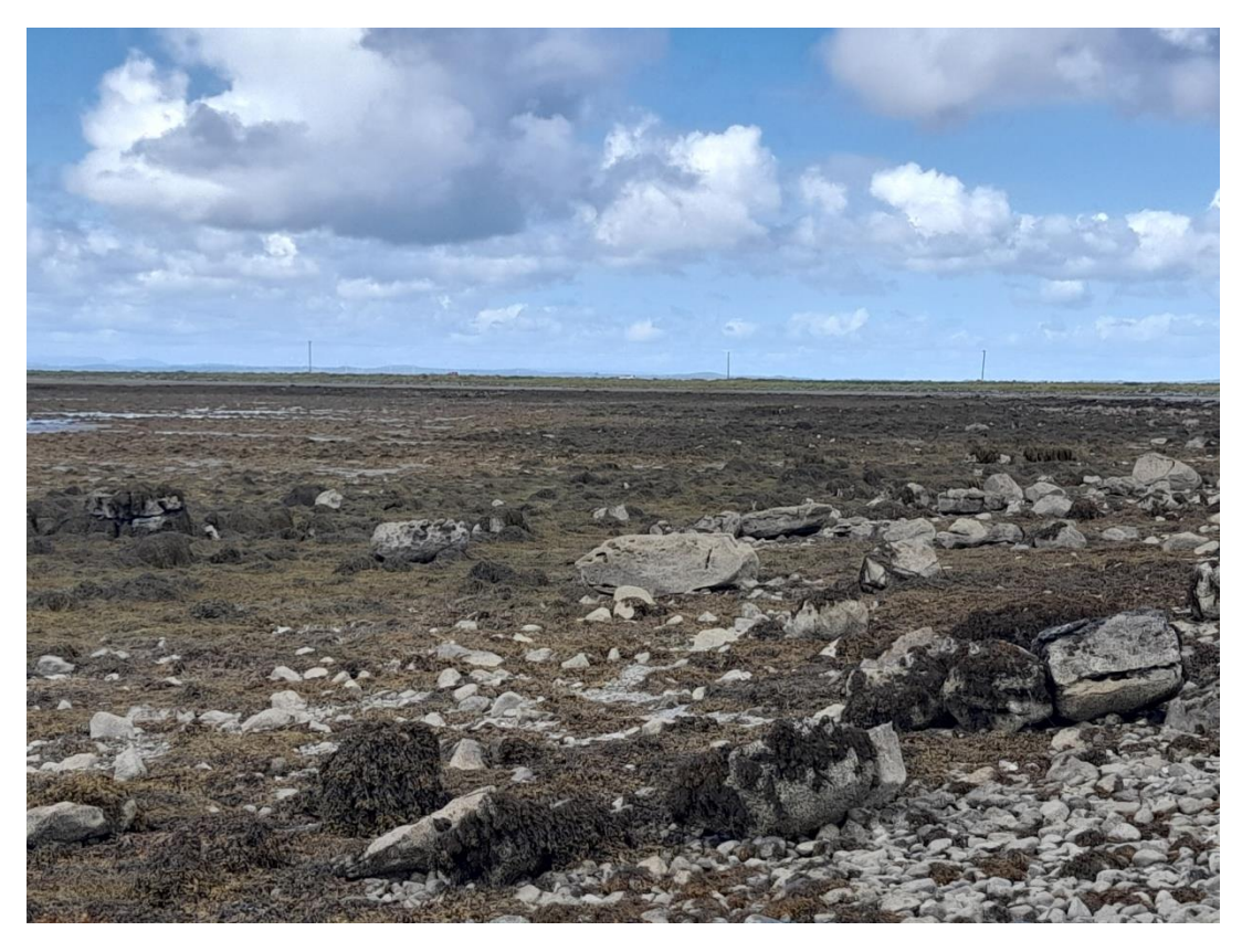
Figure 2: Upper intertidal, eastern side of shore, close to proposed access point.

with rocks, with a diameter ranging from approx. 15-30 cm covers the majority of the intertidal area, as can be seen in Figure 3.